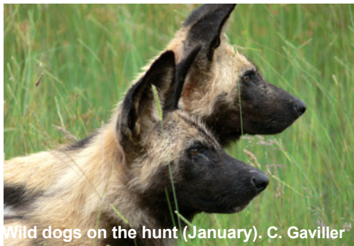
Wild dogs on the hunt (January). C. Gaviller