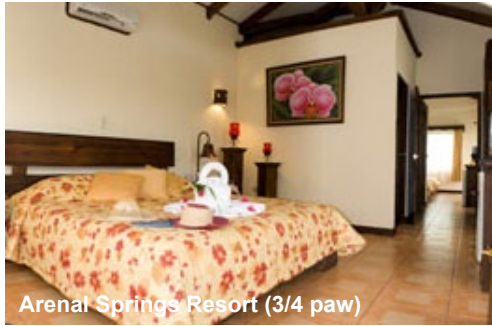
Arenal Springs Resort (3/4 paw)