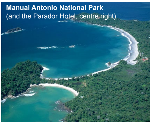
Manuel Antonio National Park (and the Parador Hotel, centre right)