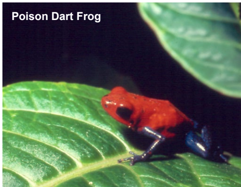
Poison Dart Frog