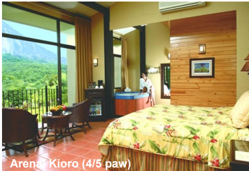
Arenal Kioro (4/5 paw)